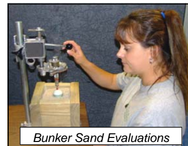
Bunker Sand Evaluations

Testing is performed according to strict laboratory SOPs that meet or exceed industry standards.